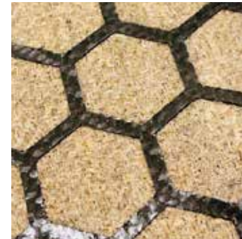
TEXTURE WITH HEXAGONAL SCRAPS OF CARBON AND LINEN