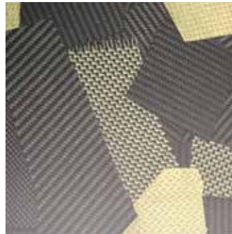
CARBON AND KEVLAR SCRAPS